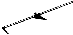
Brake Drum Gages