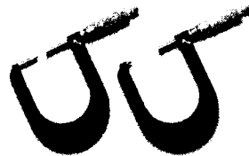
Disc Brake Micrometers

4 Models- English #6202 & 6203 & Metric #6212 & 6213