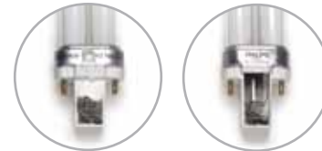
Bounce Bulb vs. Standard Bulb